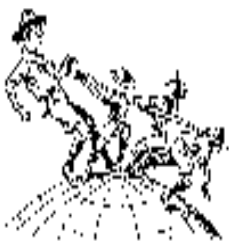
The World of Scouting

Each unit is responsible for completing trip permits and youth permission slips. Be aware that the new trip permit requires at least one adult to have Planning and Preparing for Hazardous Weather, Safe Swim Defense, and Safety Afloat Certifications. All adults should have Youth Protection. These certifications are all available on-line